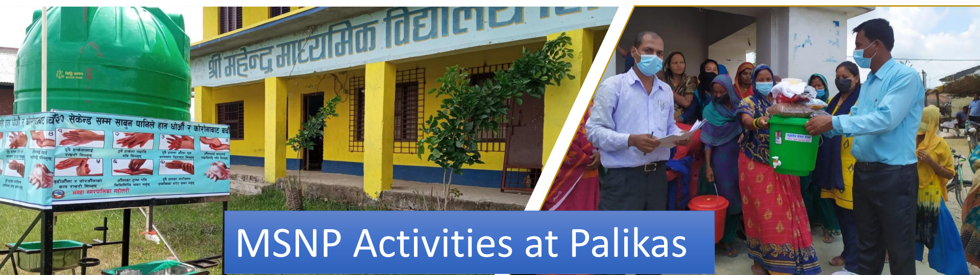
MSNP Activities at Palikas