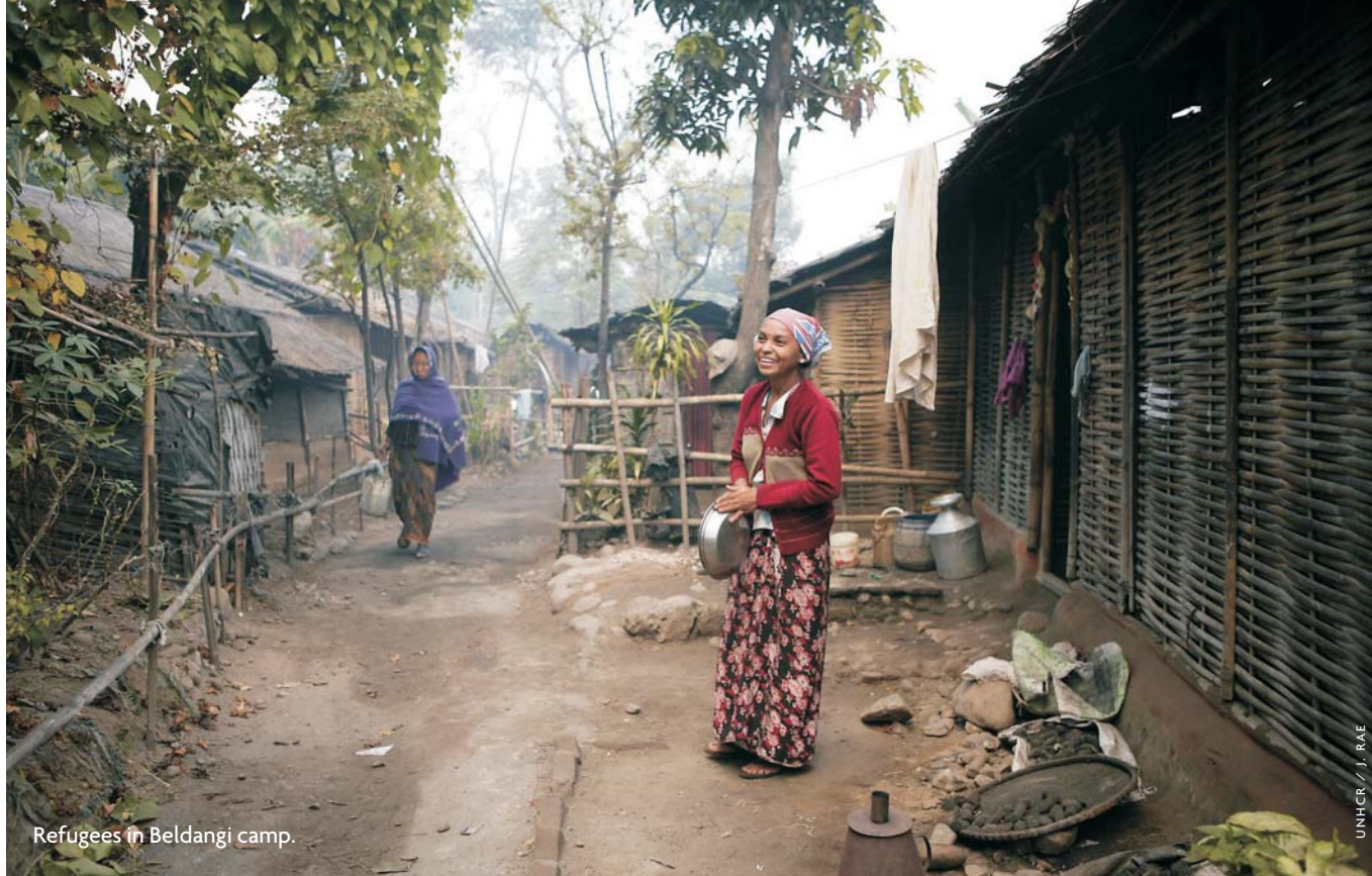
Refugees in Beldangi camp.