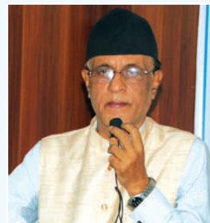
Hon. Govinda Sharma Paudyal, NHRC (During regional training in Pokhara)

A separate act to address the issues of mentally disabled persons is essential, and in this regard, NHRC is working to raise awareness, advocate, and monitor the human rights issues of mentally disabled persons to materialize its slogan 'Human rights in every household, a base of peace and development'. The training is a part of it.