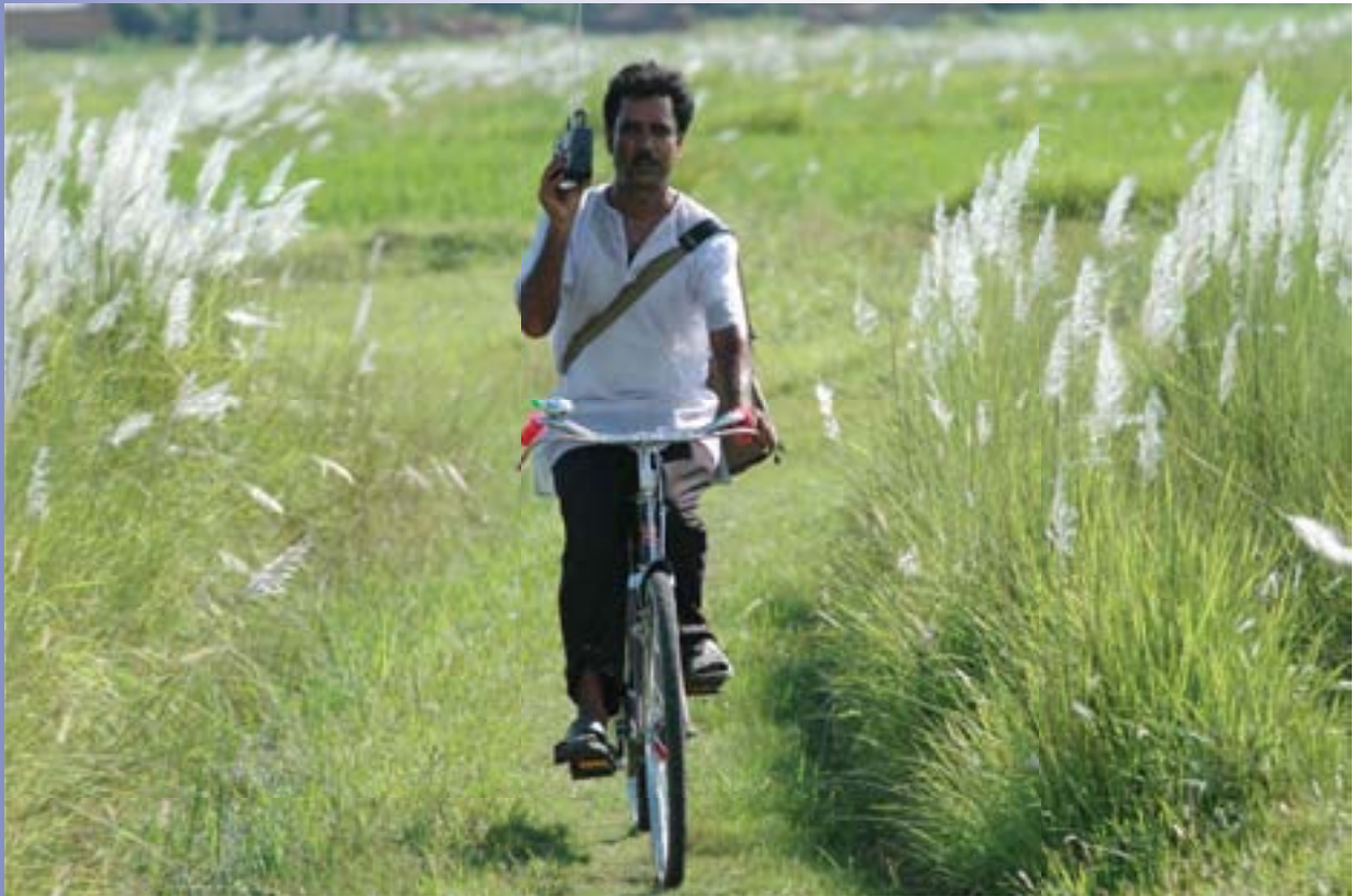
Radio Rep Cycling and listening to a community radio programme at the same time

As regards thematic areas of intervention, UNESCO's action will focus on three main areas of action: Enabling freedom of expression for fostering development, democracy, and dialogue for a culture of peace and nonviolence;