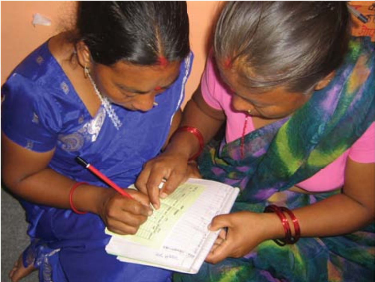
Saving and credit training is a vital component of a literacy programme at Madhawalja Community Learning Centre

Regarding higher education, UNESCO supported national efforts to develop a comprehensive policy. In addition, UNESCO provided support in undertaking research on “Advancing Policy Options for Higher Education: Improving Transition and Access to Higher Education in Nepal” and contributed in capacity development of MoE officials and university teachers with a particular focus on scientific research and innovation.