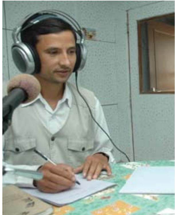
Science lessons are broadcast via the Madan Pokhara Community Radio station

The UCPD Nepal is structured as follows: