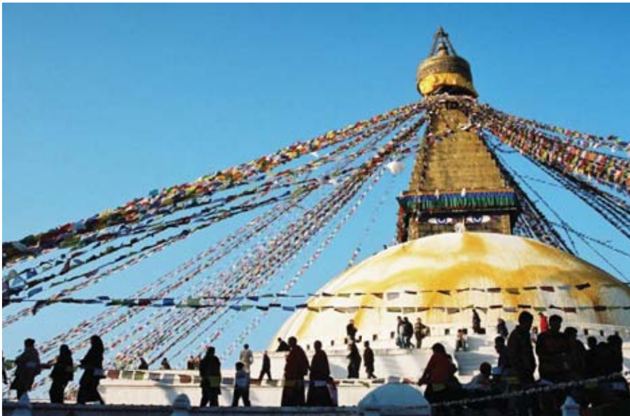
Buddhanath, one of seven monument zones on the Kathmandu Valley World Heritage Property list

Nepal is characterized by a very rich diversity of culture and tangible and intangible heritage. The main features of the country's tangible heritage are the four properties inscribed on the World Heritage List in the categories of world cultural and natural heritage. The two cultural properties are the Kathmandu Valley, with its seven monument zones 29 (1979) and Lumbini, the Birthplace of Lord Buddha (1997). The two natural heritage properties are the Chitwan National Park (1984) and the Sagarmatha National Park (1979). Many other sites included in the Tentative List of World Heritage and those included in the national inventory reflect the rich history of the country.