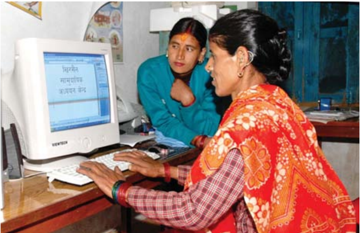
Learning reading and writing with the aid of a computer

As envisaged in the EFA National Plan of Action 2001-2015 and the School Sector Reform Plan (SSRP) 2009-2015, education revolves around achieving three objectives: ensuring access and equity in primary/basic education; enhancing