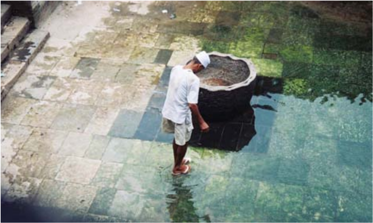
A drainage problem affects a historical stone spout in Patan Durbar Square

up support from the Asia and Pacific Science Regional Bureau in Jakarta.