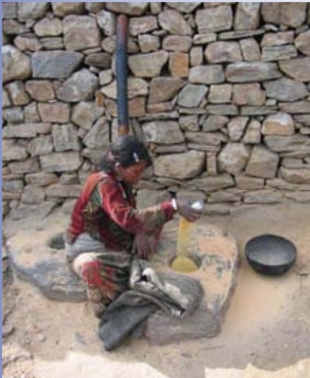
A woman from Humla grinds grain in a traditional grinder

In the area of natural sciences, UNESCO's contribution will focus on meeting the country's needs with science-based solutions, particularly through assisting the GoN to review policies related to S&T. This will include building institutional capacity to promote scientific research and regional and international collaboration, strengthen technology transfer for increased productivity, and mobilize science and technology for sustainable development and climate change adaptation and mitigation. Activities will be carried out in conjunction with the Regional Science Support Strategy 2010-2013 of UNESCO's Regional Office for Science in Jakarta. 47 Potential working priorities and activities are summarized under the themes of "Policy Review and Strengthening Science, Technology and Innovation" and "Mobilizing