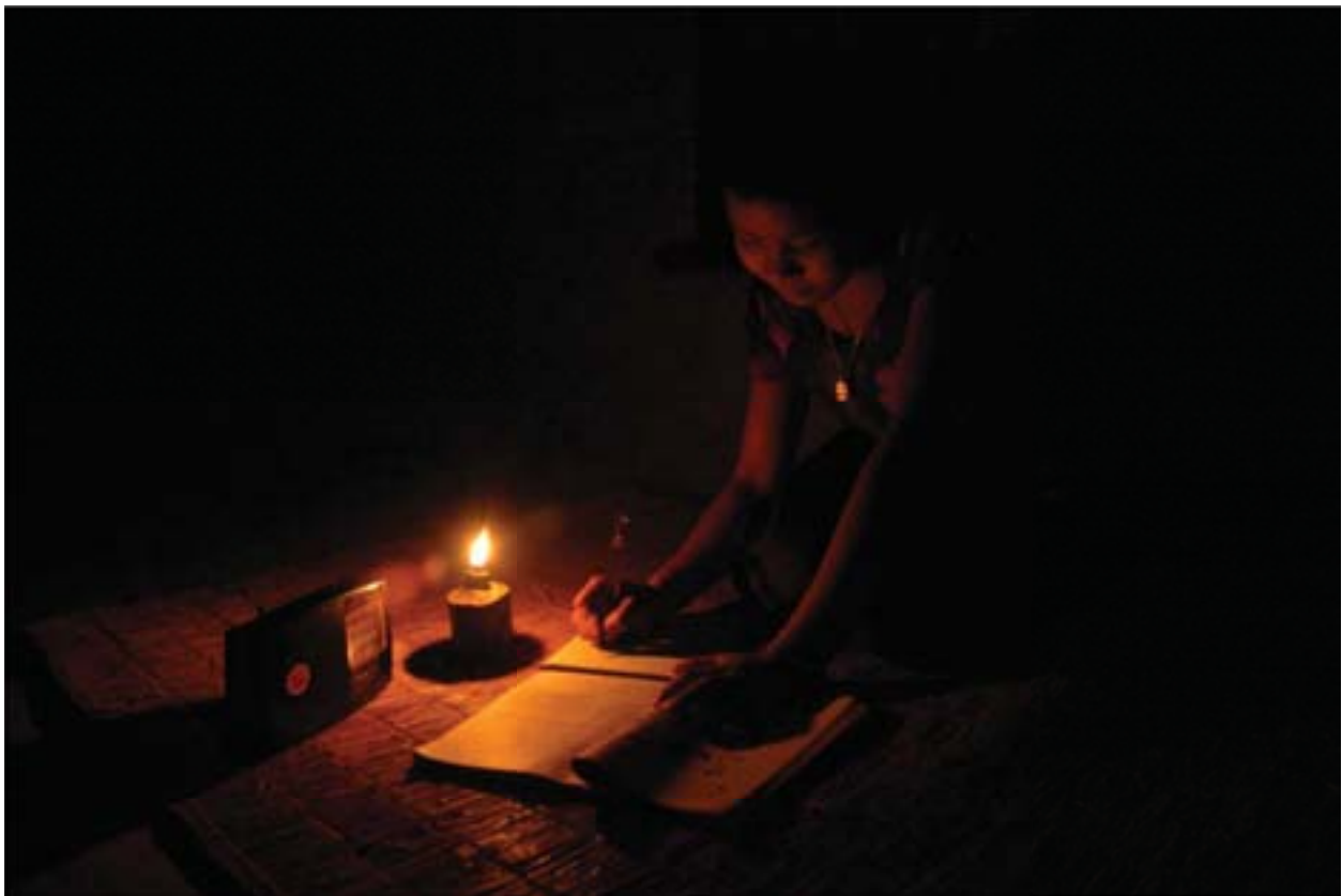
A student in a remote area listens to a lesson broadcast over the radio.

A significant achievement in terms of transparency and greater access to information on public affairs was the adoption of the Right to Information Act (2007), and the subsequent formation of the National Information Commission. However, due to a lack of capacity, appropriate information dissemination systems and political will, challenges remain in implementing the Act.