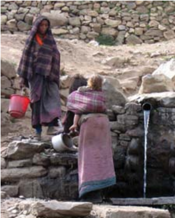
Getting drinking water in Humla