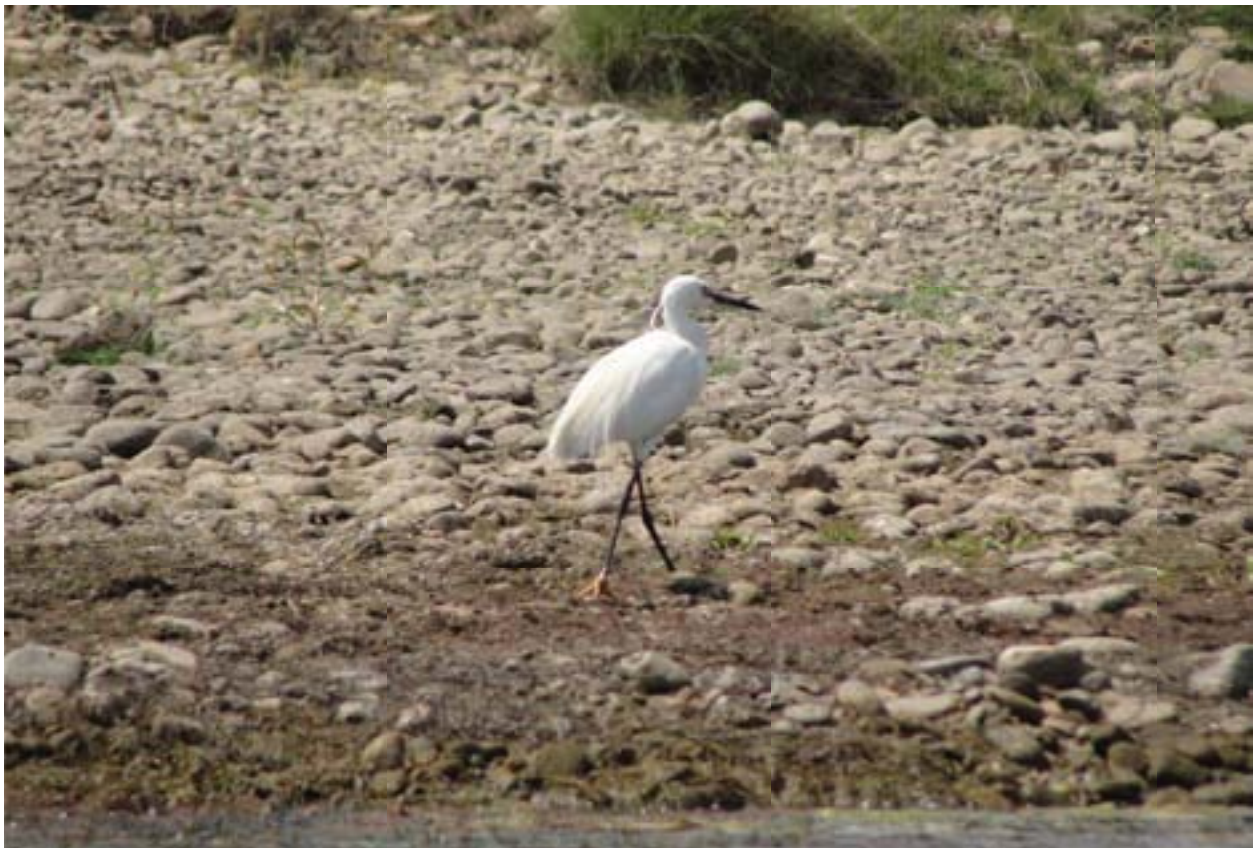
Environmental degradation poses a threat to endangered rare species

Historically, the path to modernization had major implications for natural sciences. In the 1950s, several science and technology (S&T) services