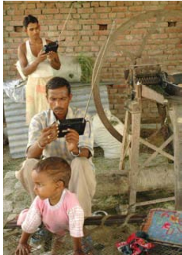
Members of the Muslim community listen to a community radio programme in Lumbini

The UNESCO Office in Kathmandu has helped to empower the people of Nepal through the free flow of ideas and access to information and knowledge. In particular, UNESCO supported peace efforts by building the capacity of journalists, supporting the creation and development of both community multimedia centres and community radio stations, promoting press freedom and the right to information, and fostering access to information and knowledge.