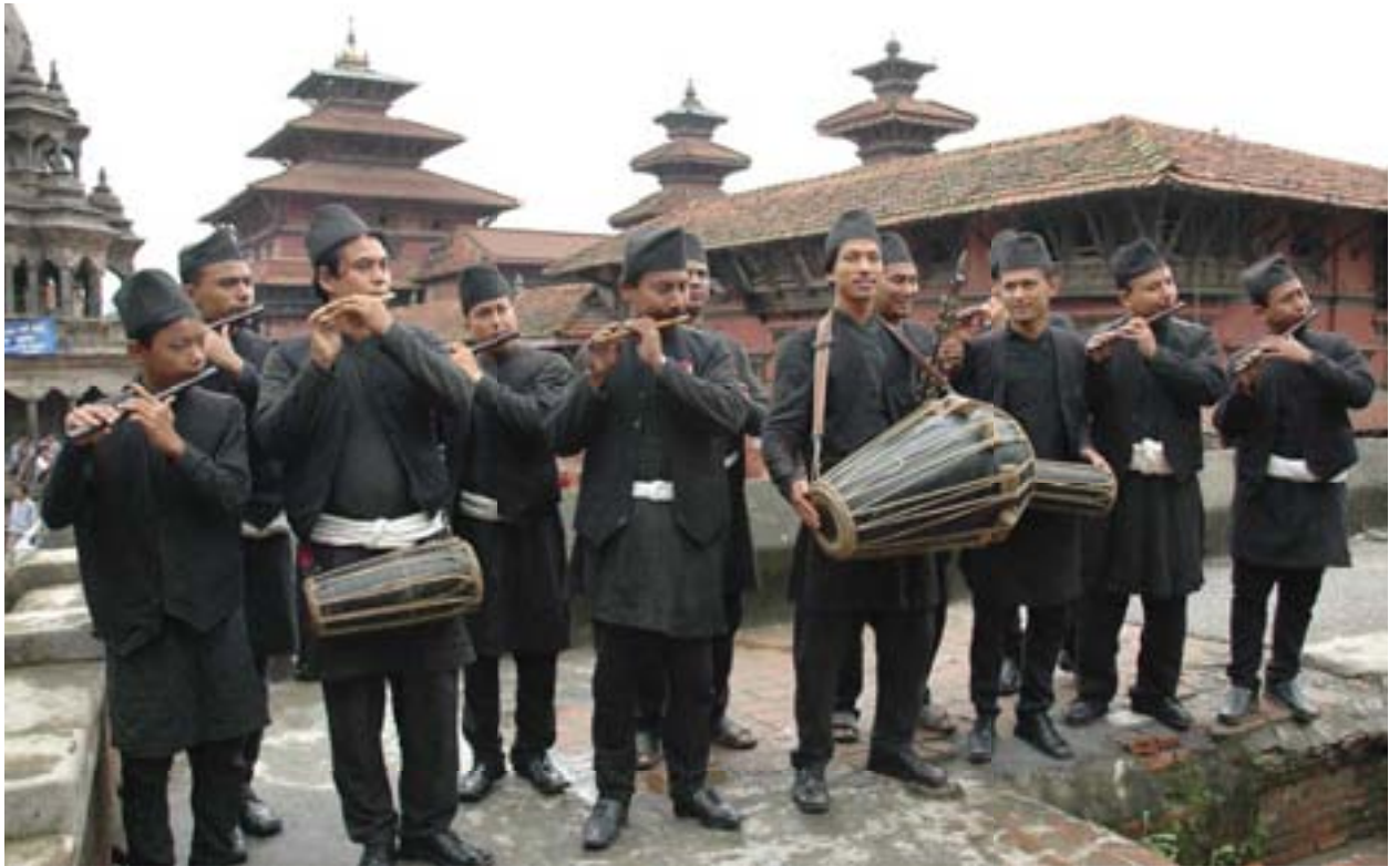
Volunteers from Tamsipakha Community Learning Centre play traditional Newari music in Patan Durbar Square

Since the inscription of the Kathmandu Valley onto the List of World Heritage Sites in Danger in 2003, UNESCO concentrated its efforts