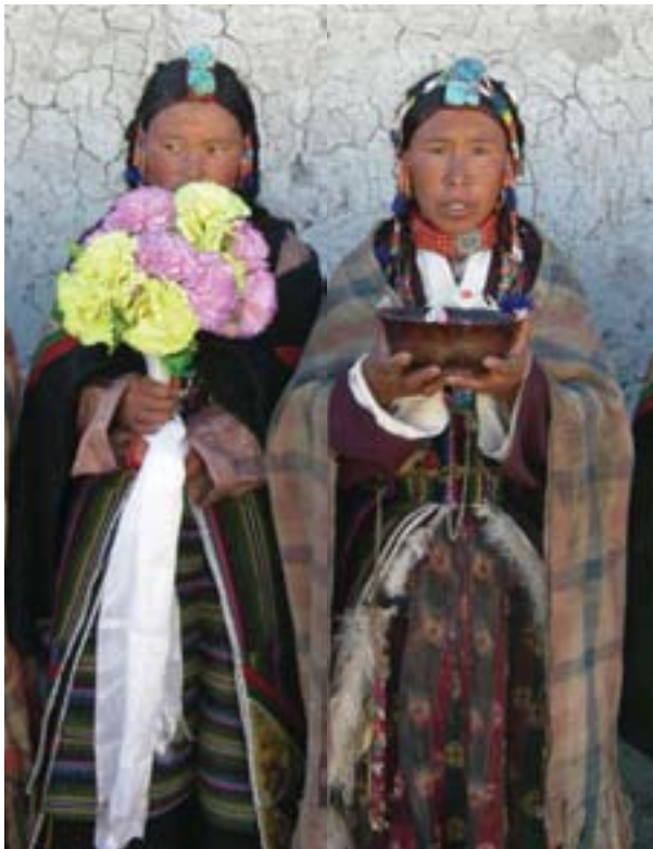
Women from Humla dressed in traditional attire

key programme priorities based on the needs of stakeholders and country development requirements. In this way, the UCPD is an important tool to facilitate the planning, implementation and monitoring of programmes and projects that are, and will be supported by UNESCO. The UCPD aims to clarify and assert the organization's responsibilities and concrete contributions in building peace, alleviating poverty, and fostering sustainable development and intercultural dialogue in Nepal in partnership with the government, other development partners and the United Nations Country Team.