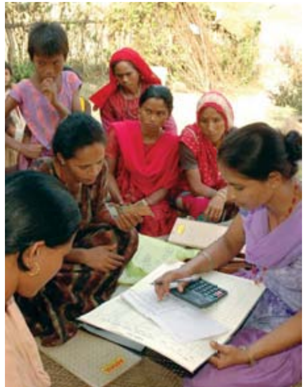
The Women's Savings Group at Kohlpur Community Learning Centre