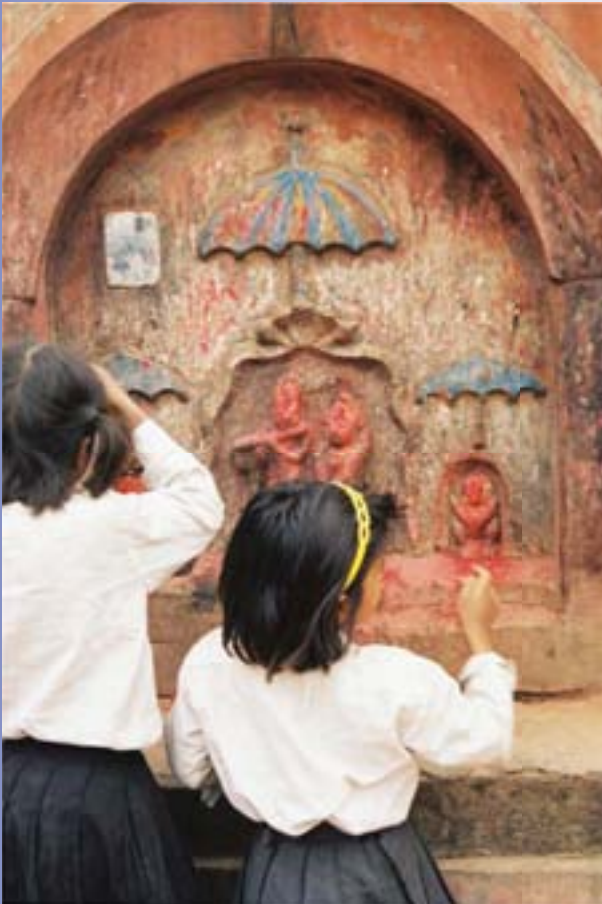
Schoolgirls worship in a temple in Bhaktapur

and integrating the principles of those already ratified into national policies and legislation.