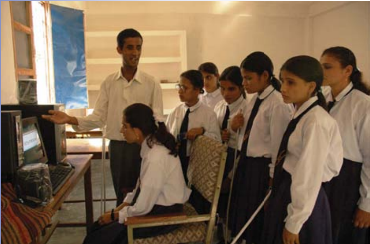
Teaching basic computer skills to visually impaired girls and boys

Under the overall goals to achieve Education for All by 2015, UNESCO will focus on literacy and lifelong learning, teacher training and education planning. UNESCO will put special emphasis on women and disadvantaged groups and on developing the capacities of CLCs to address their needs through mother tongue-based literacy. In this context, activities will focus on